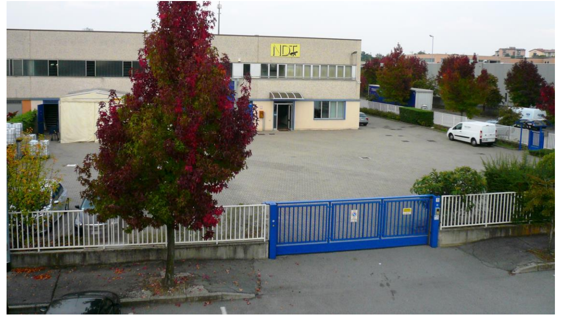
NDT factory in Italy, near Milan