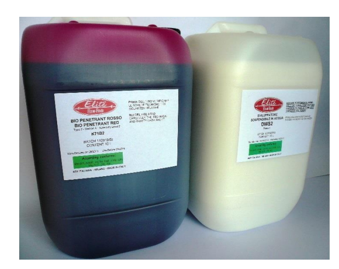
K71B2 BIO red penetrant+ Elite DWS2 developer